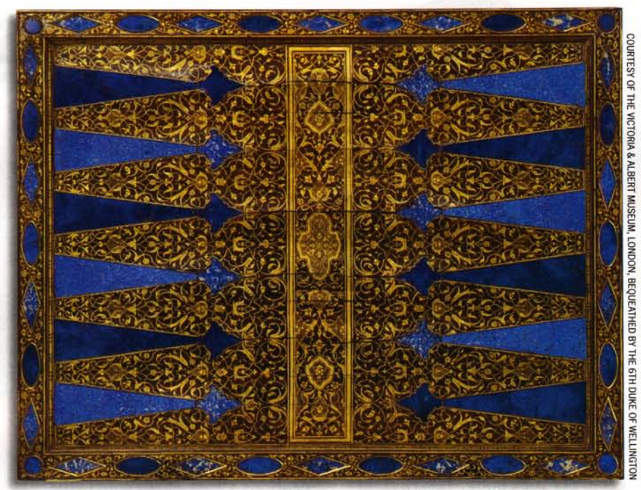
Game board made in Venice, Italy, c. 1570-90, veneered with tropical hardwood (probably rosewood) and three patterns of lapis lazuli, with gilded Moresque decoration. It has a chess board on one side and half a backgammon board on the other, which would have formed half of a 16th-Century "pair of tables" with another similar board, completing the backgammon board and providing—on the reverse—a board for Nine Men's Morris.

Owners of vintage American homes-as well as people who adopted early American décor for newer homes—usually put game boards on walls as a decorative feature. The sweeping popularity of the country look that began in the 1970s broadened the attraction of game boards so much that they soon