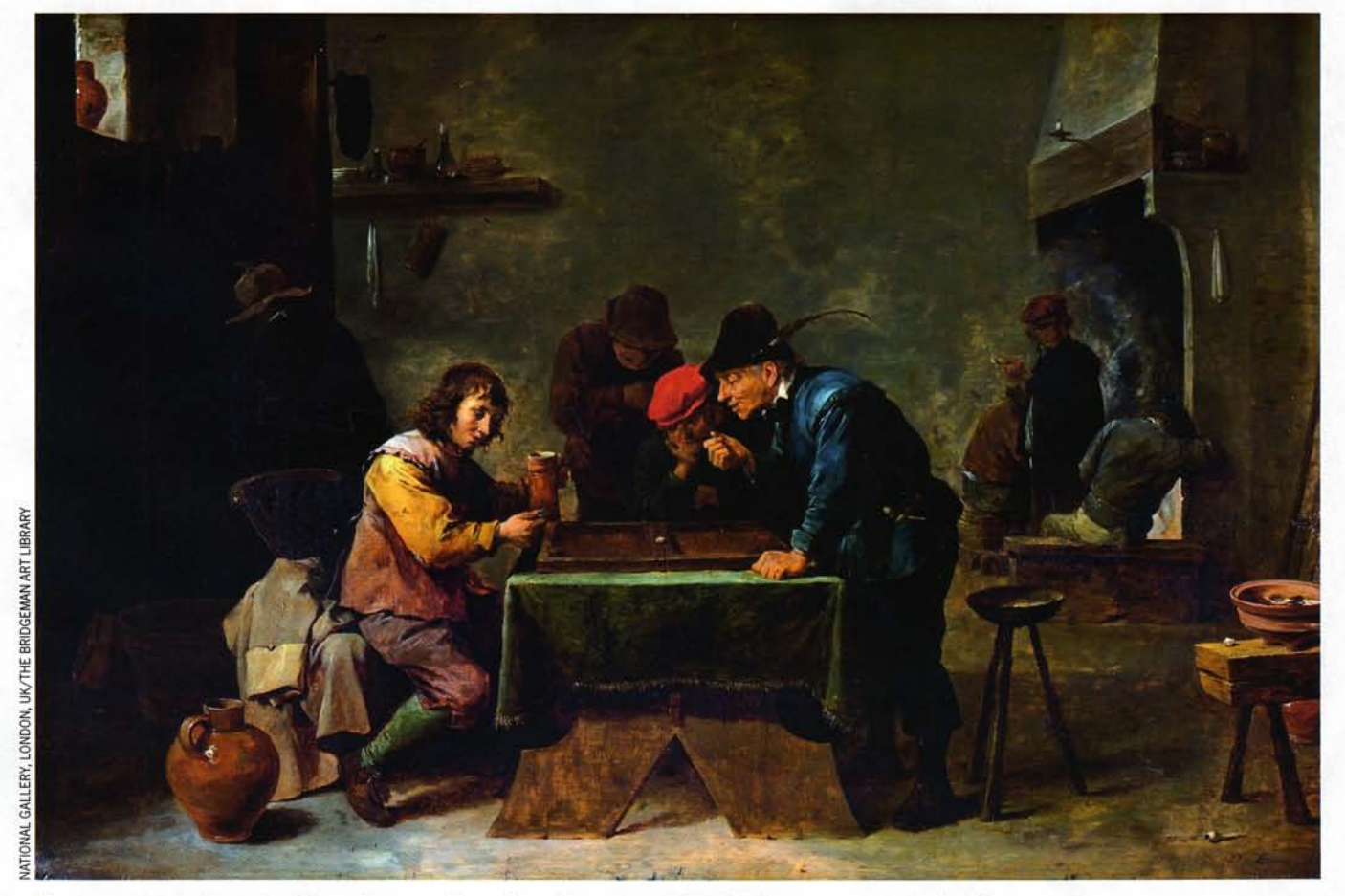
Tavern patrons often played—and wagered on—board games such as backgammon, as depicted here in Backgammon Players, c. 1640-45, oil on wood by David the Younger Teniers (1610-90).

Look ahead two centuries to 1968 and you'll see the same backgammon board has found its way